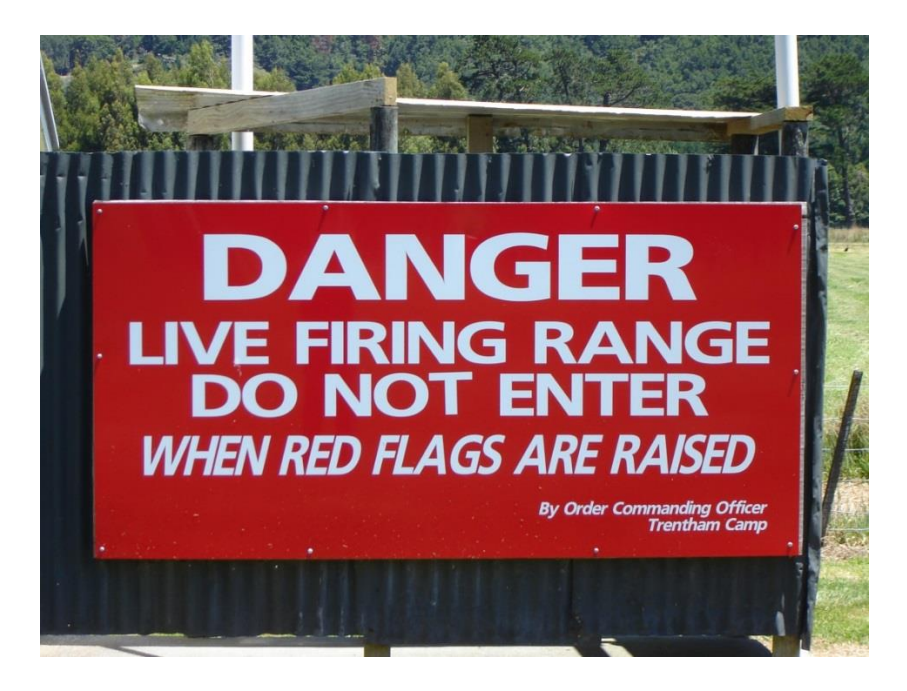
Range Danger Sign Used on Trentham Ranges

e. Below is an image of a Range Danger Sign used on Trentham Ranges.