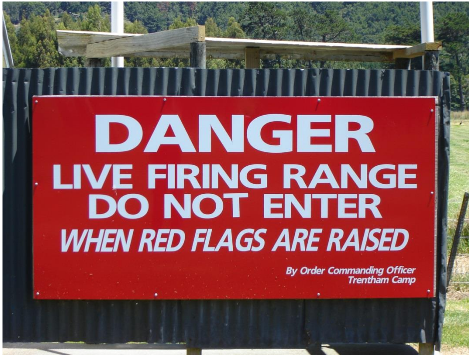
Range Danger Sign Used on Trentham Ranges

13. Range Safety Certificates. An NZDF Range Safety Certificate has been produced for NRA use of Seddon Range. The current safety certificate is located in one of the clear plastic envelopes on the green coloured Seddon Range sign adjacent to the NRANZ Headquarters. A copy of the Seddon Range Safety certificate is located at Annex B to this Chapter.