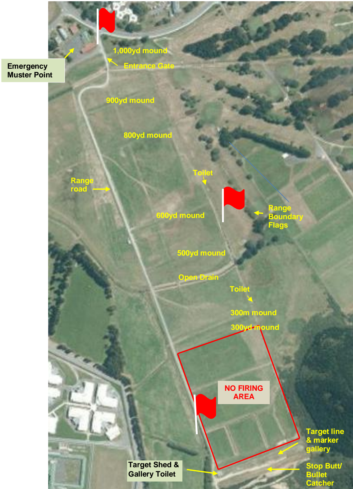
Aerial image depicting Seddon Range features